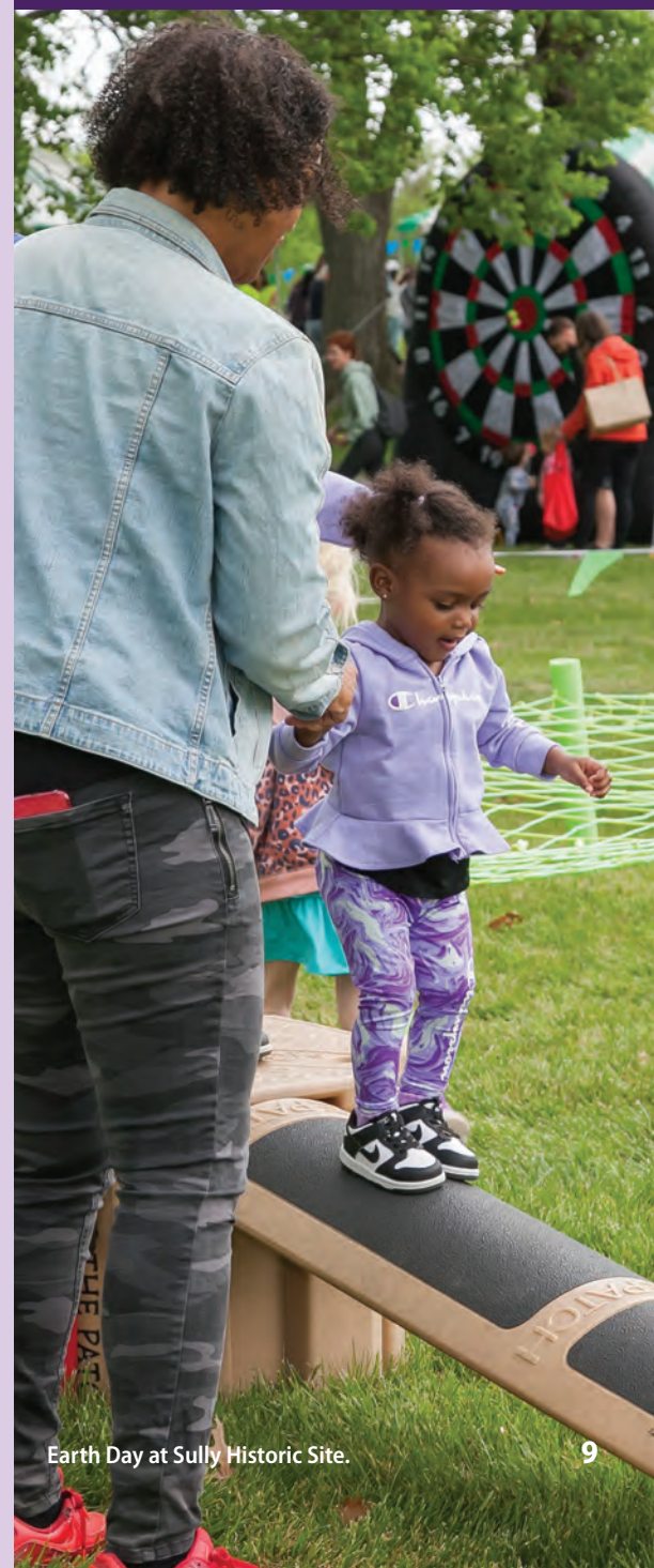
Earth Day at Sully Historic Site.

Spring Scramble Tournament Pinecrest Golf Course pg. 108